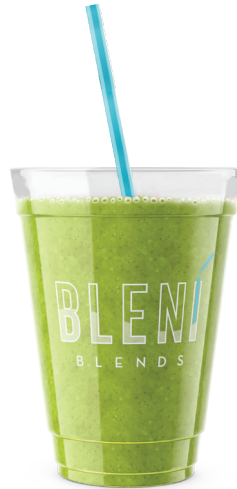
GREEN POWER BLENI