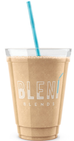
VANILLA FRAPPÉ BLENI

BANANA BLUEBERRY · RASPBERRY & BLACKBERRY