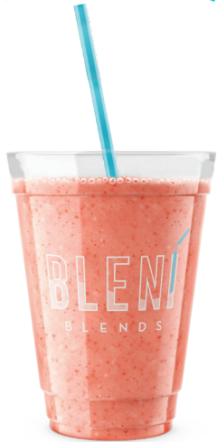
STRAWBERRY BANANA BLENI